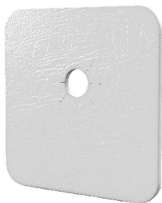
Freevent Dressing SoftFoam Slim L (80 x 80 x 2,5 mm)