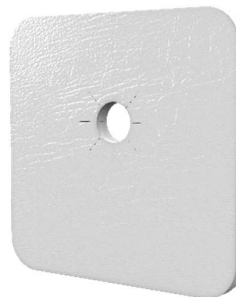
Freevent Dressing SoftFoam L (80 x 80 x 5 mm)